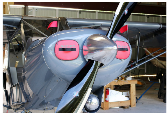
Piper PA-18 Super Cub Engine Inlet Plugs