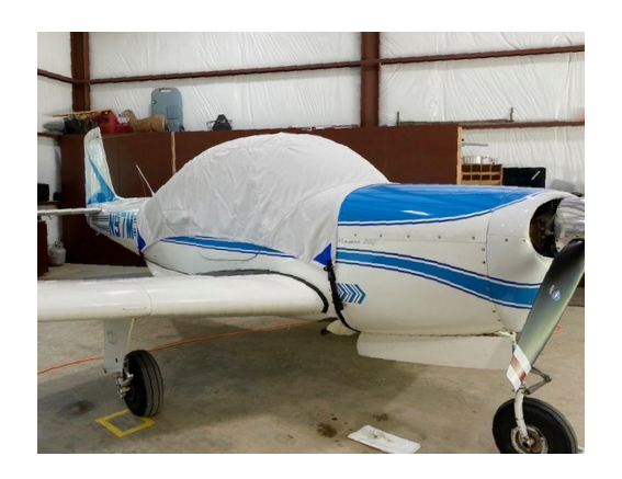
Meyers (Rockwell) 200 Canopy Cover