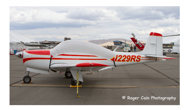
Meyer (Aero Commander) 200 Canopy Cover

This cover type is made from Silver Acrylic Sunbrella canvas and is 100% lined with a soft and smooth microfiber. Bruce's Custom Covers developed this material combination especially for aircraft protection. The outer material is medium weight and treated for water resistance, UV resistance and anti-static buildup. The inner lining is a very soft and smooth microfiber to prevent scratching. The material is very reflective, and tests show that the cabin interior temperature can be reduced to near-ambient temperature on the hottest of days. It is water, ice and snow repellent, yet breathable to allow moisture to escape from between the cover and the aircraft surface.