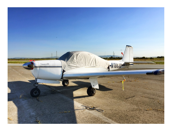
Meyer (Aero Commander) 200 Canopy Cover