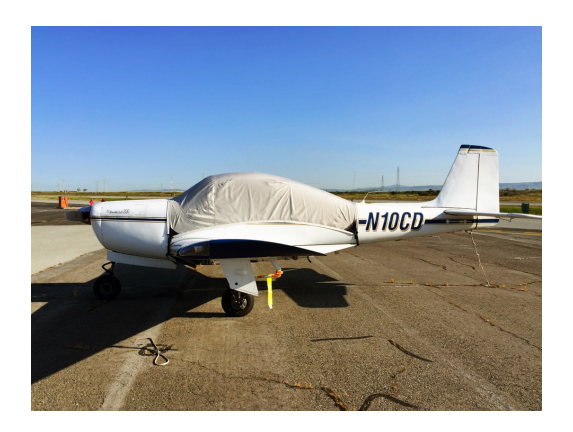
Meyer (Aero Commander) 200 Canopy Cover