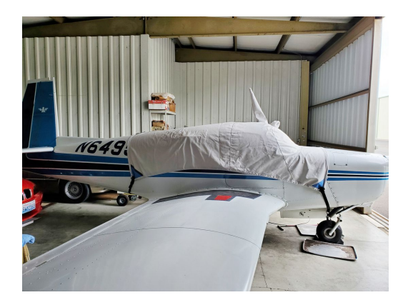
Mooney M20C Canopy Cover with Forward Extension

This cover type is made from Silver Acrylic Sunbrella canvas and is 100% lined with a soft and smooth microfiber. Bruce's Custom Covers developed this material combination especially for aircraft protection. The outer material is medium weight and treated for water resistance, UV resistance and anti-static buildup. The inner lining is a very soft and smooth microfiber to prevent scratching. The material is very reflective, and tests show that the cabin interior temperature can be reduced to near-ambient temperature on the hottest of days. It is water, ice and snow repellent, yet breathable to allow moisture to escape from between the cover and the aircraft surface.