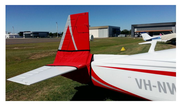
Mooney M20J Tailcone Cover

WINTER USE MATERIAL - Made with Solution-Dyed Polyester fabric, this option is intended for seasonal use to aid in deicing, rain mitigation, or for occasional travel. The material is lighter and more compact, but more susceptible to UV damage and may have a shorter useful life if used continuously outside than the all-year use material.