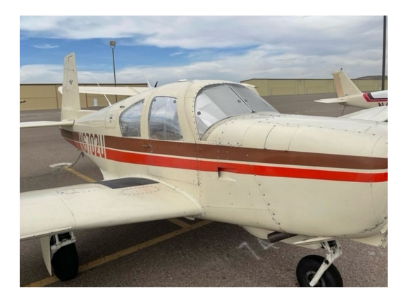
Mooney M20C Heatshield Set

Windshield Heatshields are interior sunshades for an aircraft's front windshield. The product is a unique composite of closed-cell foam with a silver mylar finish. The semi-rigid design is stiff enough to stand along the inside of the windshield using sun visors or window framing. It folds up flat and easily stores in the included storage sleeve. Some designs may require velcro and suction cups or split right and left sides. A Heatshield is an excellent short-term remedy for cockpit overheating. An external fabric cover is far more effective and practical for long-term protection.