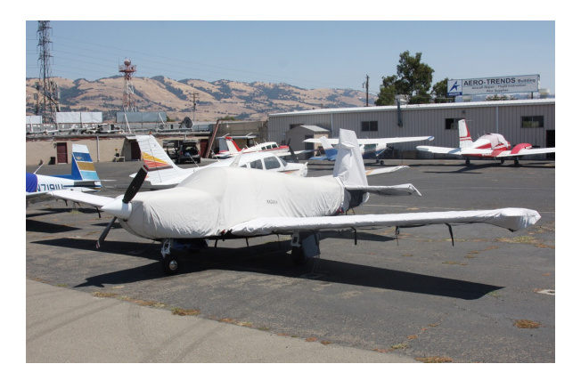
Mooney 231 Full Cover Set