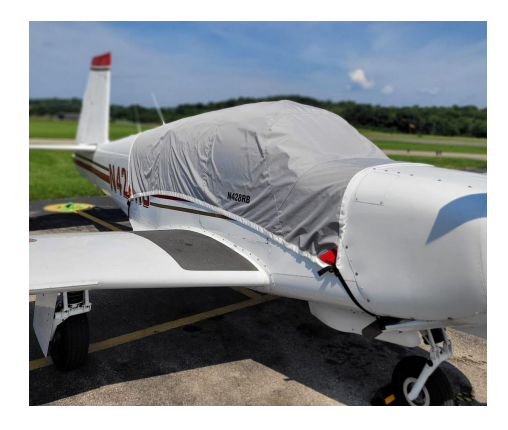
Mooney M20D Travel Cover, Light Weight Canopy Cover with Forward Ext (1964 & before)