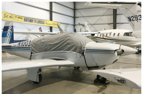
Mooney 201 Travel Cover, Light Weight Travel Canopy Cover, 5 Lbs