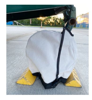
Mooney 201 Nose Wheel Cover

ALL-YEAR USE MATERIAL - Made with Silver Acrylic Sunbrella canvas, the all-year use material is the best option for sun protection and cover longevity. This heavier more durable material is intended for all weather conditions, such as rain and snow or lots of sun.