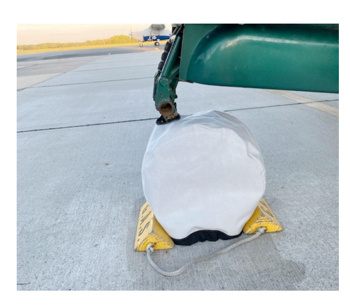
Mooney 201 Nose Wheel Cover