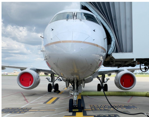
Embraer EMB-170/175 Engine Inlet Plugs

The Engine Inlet Plugs are custom fit for your Embraer EMB-170/175 intakes, made with heavy-duty vinyl material, and stuffed with a single block of sculpted urethane foam. Each plug has a zipper that allows the foam to be removed and dried if necessary. Engine plugs have 'remove before flight' streamers sewn onto the face of the plugs. Most plugs are imprinted with the aircraft registration number in black for an extra charge. Storage bag NOT included. Engine plugs may be inserted after flight when the engine is still warm. Engine Inlet Plugs are commonly referred to as Cowl Plugs, Intake Plugs, Cowl Blocks, Engine Blocks, and Engine Bungs.