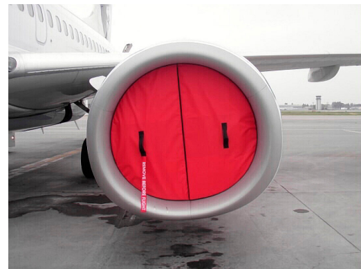
Boeing 737 Engine Intake Plug, Folding Type