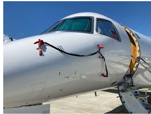
Embraer ERJ-135 Pitot/TAT/Ice Detector Covers