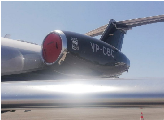
Embraer 135 Engine Inlet Plugs

The Engine Inlet Plugs are custom fit for your Embraer ERJ-135/140/145 Legacy 600, 650 intakes, made with heavy-duty vinyl material, and stuffed with a single block of sculpted urethane foam. Each plug has a zipper that allows the foam to be removed and dried if necessary. Engine plugs have 'remove before flight' streamers sewn onto the face of the plugs. Most plugs are imprinted with the aircraft registration number in black for an extra charge. Storage bag NOT included. Engine plugs may be inserted after flight when the engine is still warm. Engine Inlet Plugs are commonly referred to as Cowl Plugs, Intake Plugs, Cowl Blocks, Engine Blocks, and Engine Bungs.