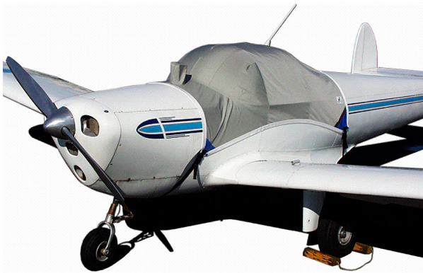
Ercoupe Canopy Cover, bubble windshield model

the Canopy Cover and Engine Cover. This cover will enclose the engine cowl and will extend aft to cover all of the windows. This cover type is made from Silver Acrylic Sunbrella canvas and is 100% lined with a soft and smooth microfiber. Bruce's Custom Covers developed this material combination especially for aircraft protection. The outer material is medium weight and treated for water resistance, UV resistance and anti-static buildup. The inner lining is a very soft and smooth microfiber to prevent scratching. The material is very reflective, and tests show that the cabin interior temperature can be reduced to near-ambient temperature on the hottest of days. It is water, ice and snow repellent, yet breathable to allow moisture to escape from between the cover and the aircraft surface.