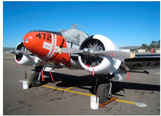
Beech 18 Cockpit Cover and Carb Air Inlet Plugs