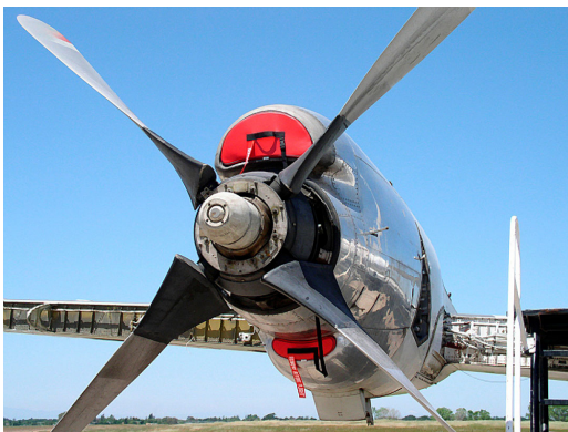
Lockheed P-3 Main Engine Inlet Plugs

Engine Inlet Plugs are custom fit for your Lockheed P-3 Orion intakes, made with heavy-duty vinyl material, and stuffed with a single block of sculpted urethane foam. Each plug has a zipper that allows the foam to be removed and dried if necessary. Engine plugs have warning flags that are visible from the cockpit or 'remove before flight' streamers sewn onto the face of the plugs. Most plugs are imprinted with the aircraft registration number in black for an extra charge. Storage bag NOT included. Engine plugs may be inserted after flight when the engine is still warm. Engine Inlet Plugs are commonly referred to as Cowl Plugs, Intake Plugs, Cowl Blocks, Engine Blocks, and Engine Bungs.