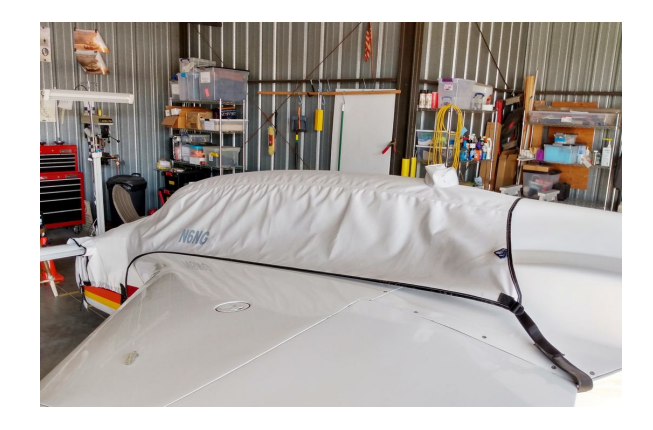
Rutan Long-EZ Canopy/Nose Cover