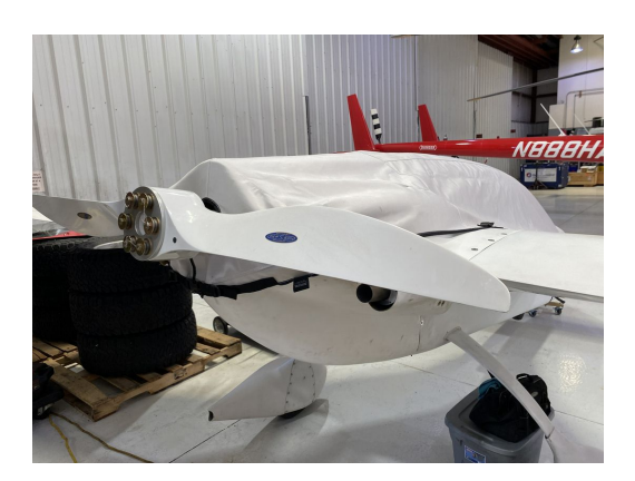
Rutan Long-EZ Canopy/Nose/Engine Cover