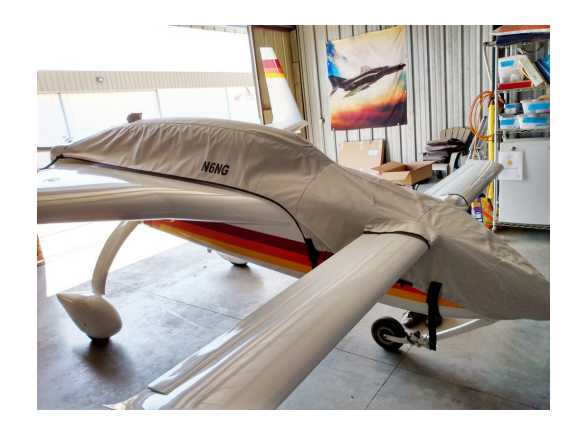
Rutan Long-EZ Canopy/Nose Cover

Travel Covers are made with Silver Solution-Dyed Polyester fabric and only lined over the windshield to save weight. The material is lightweight and more compact for easy stowage in the aircraft. The polyester material is water resistant, but only intended for occasional use outside. We also have an ultra lightweight material available for fitted hangar dust covers. For daily outdoor use, the non-travel Sunbrella Cover is the best choice.