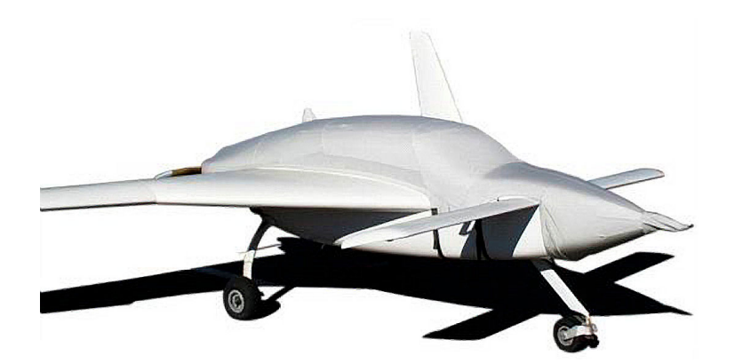
Velocity Canopy/Nose/Engine Cover

This cover type is made from Silver Acrylic Sunbrella canvas and is 100% lined with a soft and smooth microfiber. Bruce's Custom Covers developed this material combination especially for aircraft protection. The outer material is medium weight and treated for water resistance, UV resistance and anti-static buildup. The inner lining is a very soft and smooth microfiber to prevent scratching. The material is very reflective, and tests show that the cabin interior temperature can be reduced to near-ambient temperature on the hottest of days. It is water, ice and snow repellent, yet breathable to allow moisture to escape from between the cover and the aircraft surface.