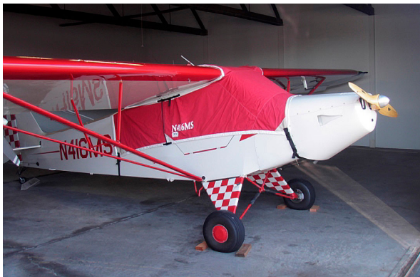
Texas Sport Cub Canopy Cover

This cover type is made from Silver Acrylic Sunbrella canvas and is 100% lined with a soft and smooth microfiber. Bruce's Custom Covers developed this material combination especially for aircraft protection. The outer material is medium weight and treated for water resistance, UV resistance and anti-static buildup. The inner lining is a very soft and smooth microfiber to prevent scratching. The material is very reflective, and tests show that the cabin interior temperature can be reduced to near-ambient temperature on the hottest of days. It is water, ice and snow repellent, yet breathable to allow moisture to escape from between the cover and the aircraft surface.