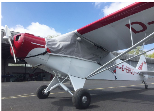
Piper Super Cub Travel Weight Canopy Cover

Travel Covers are made with Silver Solution-Dyed Polyester fabric and only lined over the windshield to save weight. The material is lightweight and more compact for easy stowage in the aircraft. The polyester material is water resistant, but only intended for occasional use outside. We also have an ultra lightweight material available for fitted hangar dust covers. For daily outdoor use, the non-travel Sunbrella Cover is the best choice.