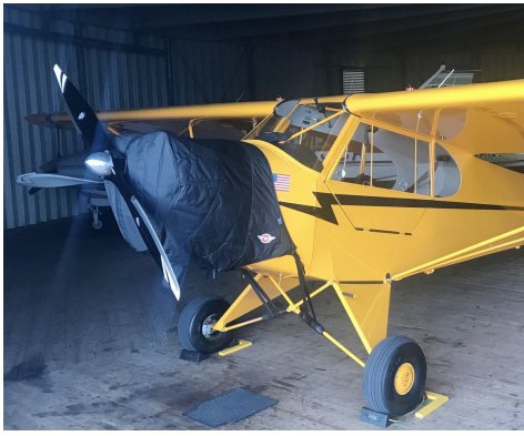
Legend Cub AL3 Insulated Engine Cover