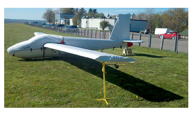
SGS 1-26B Canopy/Nose, Empennage & Wing Covers