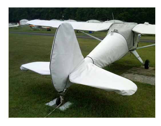
Luscombe Empennage Cover, two-piece design