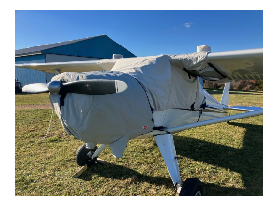
Luscombe 8A Canopy Cover, Insulated Engine Cover

This cover type is made from Silver Acrylic Sunbrella canvas and is 100% lined with a soft and smooth microfiber. Bruce's Custom Covers developed this material combination especially for aircraft protection. The outer material is medium weight and treated for water resistance, UV resistance and anti-static buildup. The inner lining is a very soft and smooth microfiber to prevent scratching. The material is very reflective, and tests show that the cabin interior temperature can be reduced to near-ambient temperature on the hottest of days. It is water, ice and snow repellent, yet breathable to allow moisture to escape from between the cover and the aircraft surface.