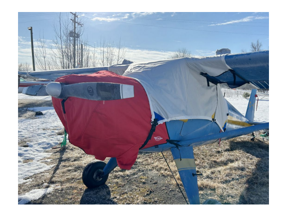
Luscombe 8A Canopy Cover, Insulated Engine Cover Luscombe 8E Canopy Cover w/Wing Extensions, Insulated Engine Cover