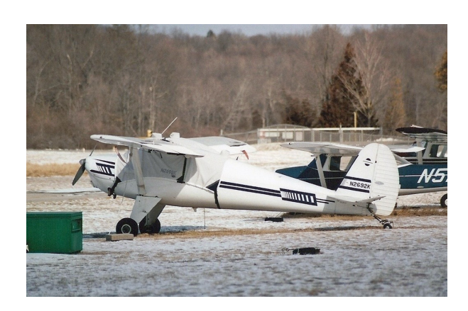
Luscombe Over-Top Canopy Cover