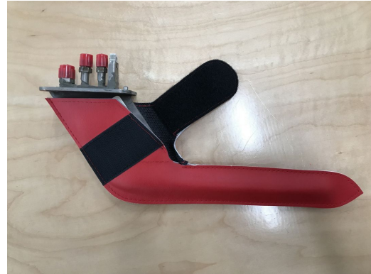
Lear 55 Pitot Cover