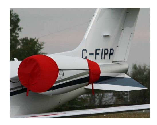
Lear 45 Engine Covers

The Lear Models 40 & 45 Bikini Style Engine Covers are a single-piece design using a soft and smooth stretchy and fabric. The cover stretches tightly over both the intake and exhaust, installing quickly and easily. These covers are designed to be used as hangar dust covers and have a useful life of approximately one year.