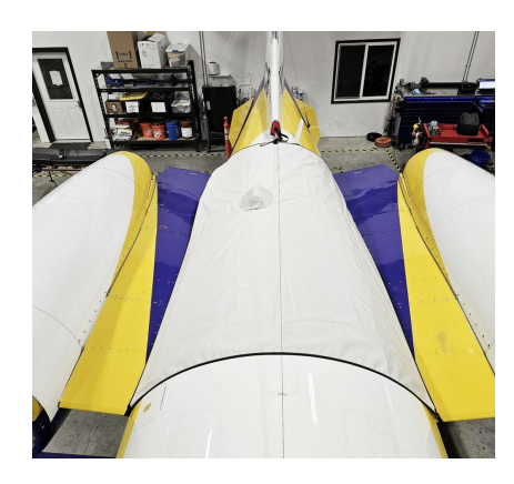
Lear 45 Empennage Saddle Cover W/ Dorsal Inlet Plug (Covers Upper Fuselage Between Pylons, Acm/Apu Area)