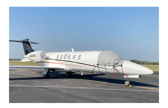
Lear 45 Light Weight Travel Cockpit Cover