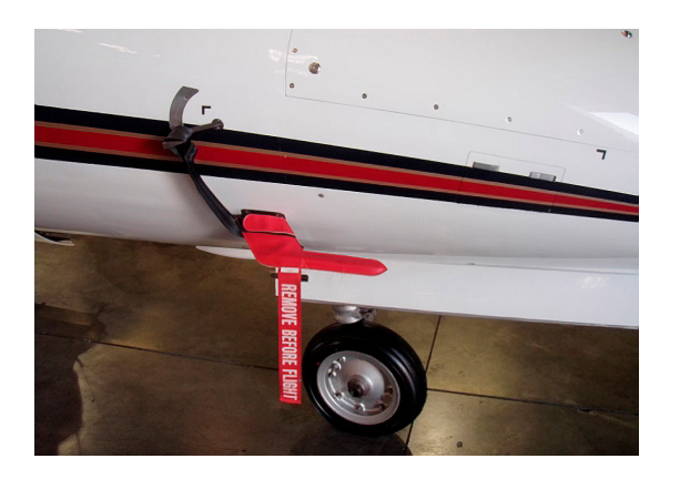
Learjet Heat Resistant Pitot Cover with AOA strap