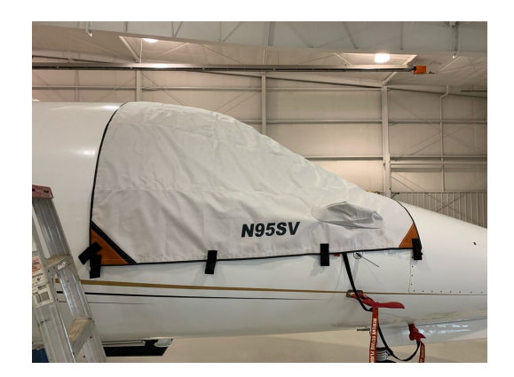
Lear 70 Cockpit Cover

This cover type is made from Silver Acrylic Sunbrella canvas and is 100% lined with a soft and smooth microfiber. Bruce's Custom Covers developed this material combination especially for aircraft protection. The outer material is medium weight and treated for water resistance, UV resistance and anti-static buildup. The inner lining is a very soft and smooth microfiber to prevent scratching. The material is very reflective, and tests show that the cabin interior temperature can be reduced to near-ambient temperature on the hottest of days. It is water, ice and snow repellent, yet breathable to allow moisture to escape from between the cover and the aircraft surface.