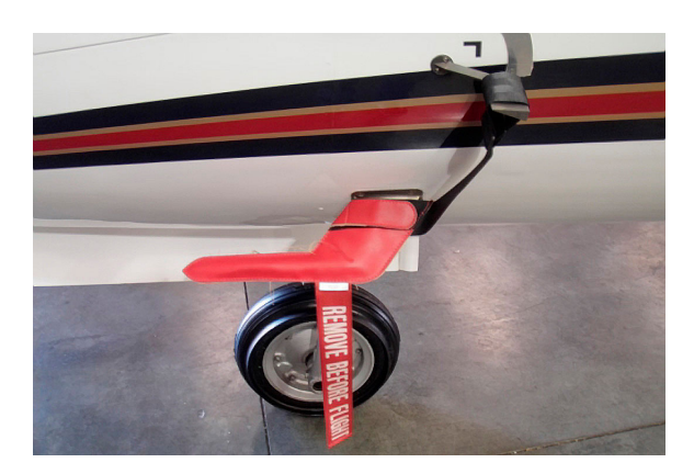
Learjet Heat Resistant Pitot Cover and AOA Strap

The Engine Inlet Plugs are custom fit for your Lear Models 40 & 45 intakes, made with heavy-duty vinyl material, and stuffed with a single block of sculpted urethane foam. Each plug has a zipper that allows the foam to be removed and dried if necessary. Engine plugs have 'remove before flight' streamers sewn onto the face of the plugs. Most plugs are imprinted with the aircraft registration number in black for an extra charge. Storage bag NOT included. Engine plugs may be inserted after flight when the engine is still warm. Engine Inlet Plugs are commonly referred to as Cowl Plugs, Intake Plugs, Cowl Blocks, Engine Blocks, and Engine Bungs.