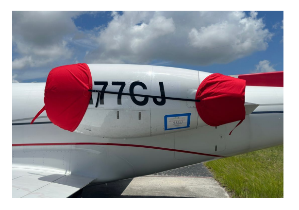
Lear 45 Engine Covers