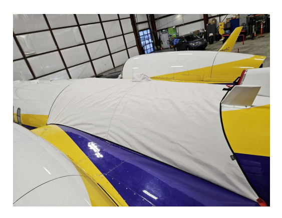
Lear 45 Empennage Saddle Cover W/ Dorsal Inlet Plug (Covers Upper Fuselage Between Pylons, Acm/Apu Area)

WINTER USE MATERIAL - Made with Solution-Dyed Polyester fabric, this option is intended for seasonal use to aid in deicing, rain mitigation, or for occasional travel. The material is lighter and more compact, but more susceptible to UV damage and may have a shorter useful life if used continuously outside than the all-year use material.