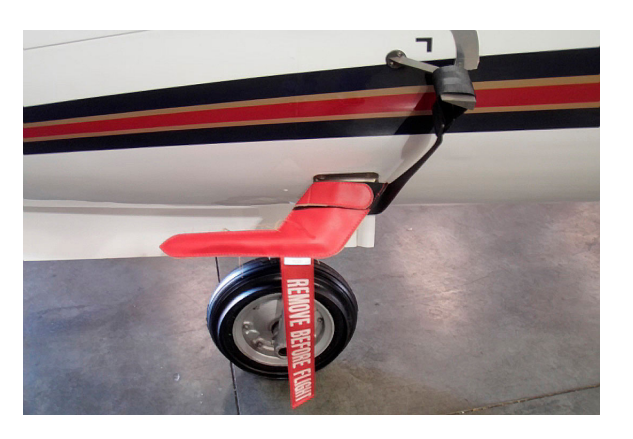
Learjet Heat Resistant Pitot Cover and AOA Strap