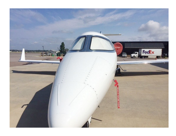
Lear Models 40 & 45 Cockpit Heatshields, Covers All Cockpit Windows