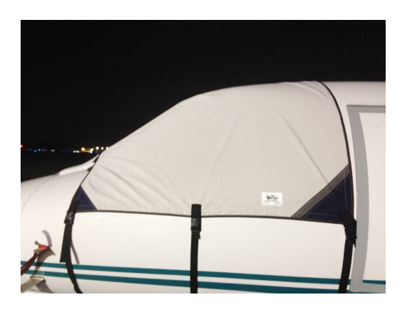
Lear 31 Cockpit Cover