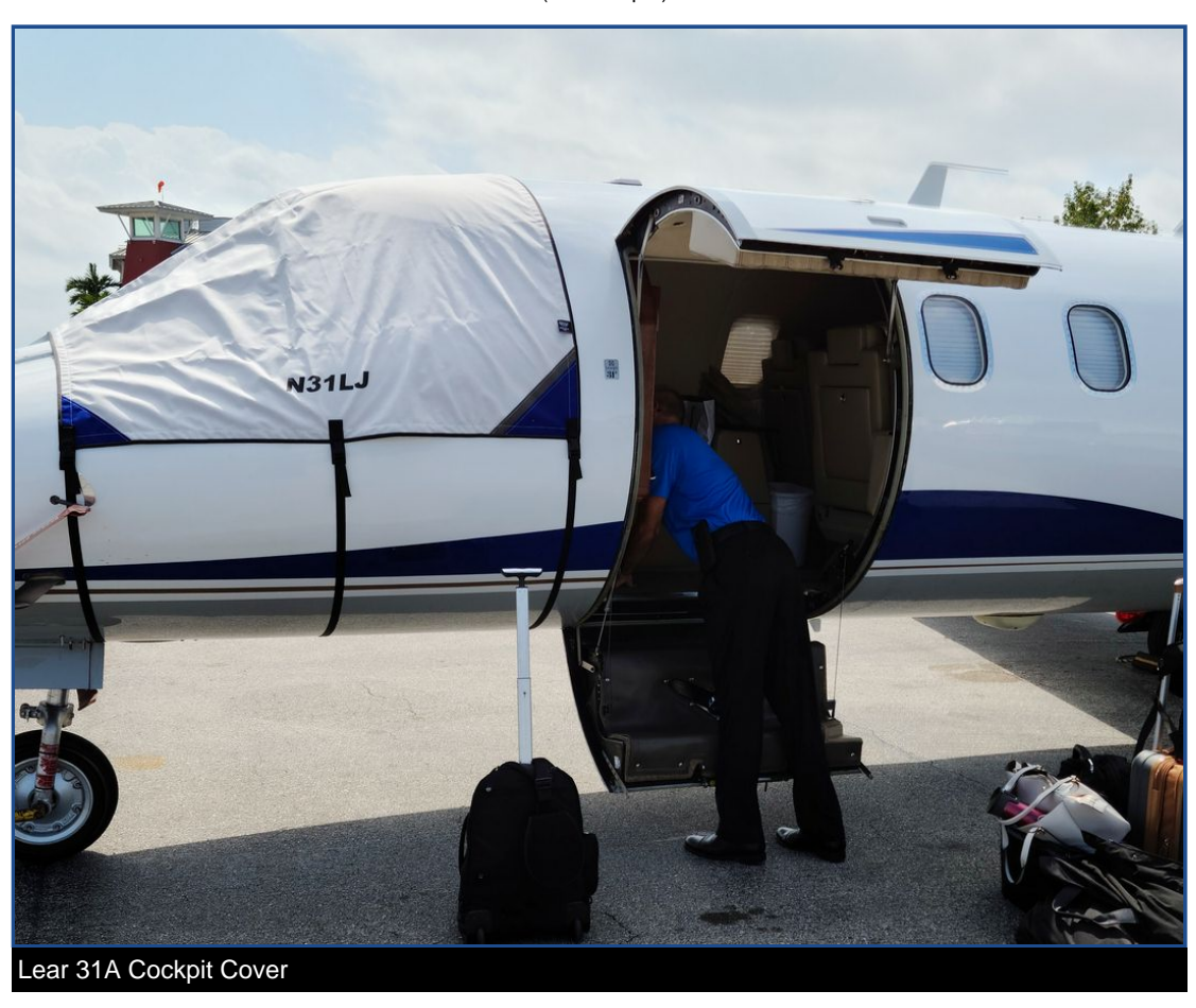
Section 1: Canopy/Cockpit/Fuselage Covers

The Lear Models 31, 35 & 36 (U.S. Military C-21) Cabin Cover helps reduce damage to the upholstery and avionics caused by excessive heat and can eliminate problems caused by leaking door and window seals. They keep the windshield and window surfaces clean and help prevent vandalism and theft.