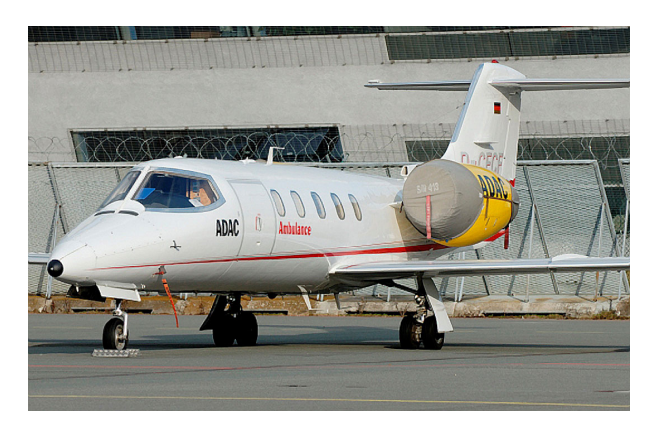
Learjet Engine Covers (come in colors)