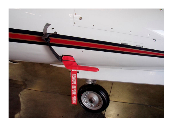
Learjet Heat Resistant Pitot Cover with AOA strap