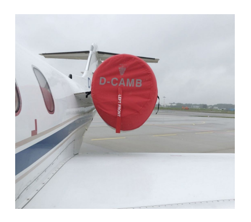
Lear 31 Intake Covers