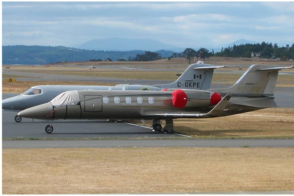
Lear 31A Cockpit Cover, Engine Covers