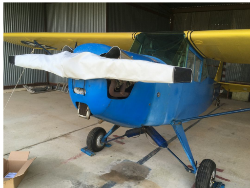
Taylorcraft L-2 Grasshopper Propellor/Spinner Cover