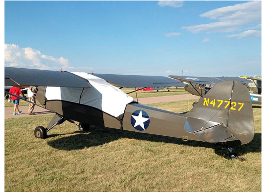
Taylorcraft L-2 Canopy Cover