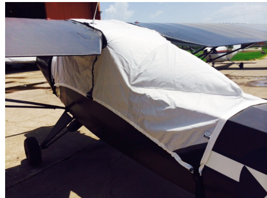
Taylorcraft L-2 Canopy Cover