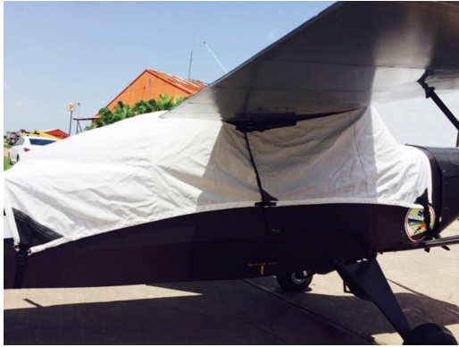
Taylorcraft L-2 Canopy Cover

This cover type is made from Silver Acrylic Sunbrella canvas and is 100% lined with a soft and smooth microfiber. Bruce's Custom Covers developed this material combination especially for aircraft protection. The outer material is medium weight and treated for water resistance, UV resistance and anti-static buildup. The inner lining is a very soft and smooth microfiber to prevent scratching. The material is very reflective, and tests show that the cabin interior temperature can be reduced to near-ambient temperature on the hottest of days. It is water, ice and snow repellent, yet breathable to allow moisture to escape from between the cover and the aircraft surface.