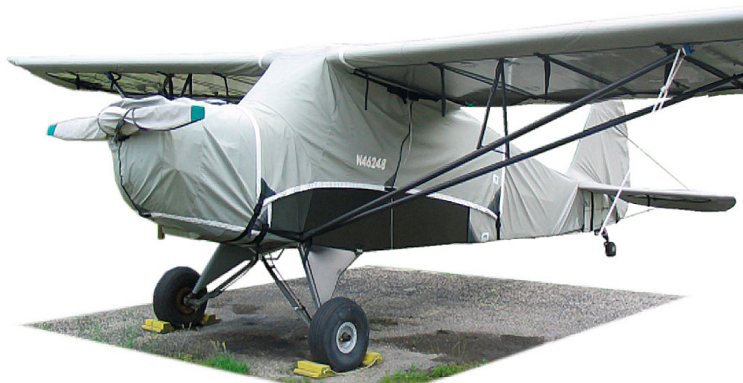
Prop Cover, Engine Cover, Canopy Cover, Wing Covers and Empennage Cover

WINTER USE MATERIAL - Made with Solution-Dyed Polyester fabric, this option is intended for seasonal use to aid in deicing, rain mitigation, or for occasional travel. The material is lighter and more compact, but more susceptible to UV damage and may have a shorter useful life if used continuously outside than the all-year use material.