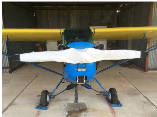
Taylorcraft L-2 Grasshopper Propellor/Spinner Cover

This cover type is made from Silver Acrylic Sunbrella canvas and is 100% lined with a soft and smooth microfiber. Bruce's Custom Covers developed this material combination especially for aircraft protection. The outer material is medium weight and treated for water resistance, UV resistance and anti-static buildup. The inner lining is a very soft and smooth microfiber to prevent scratching. The material is very reflective, and tests show that the cabin interior temperature can be reduced to near-ambient temperature on the hottest of days. It is water, ice and snow repellent, yet breathable to allow moisture to escape from between the cover and the aircraft surface.