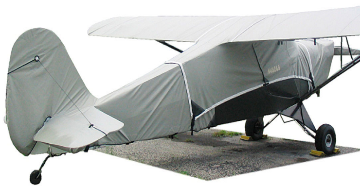
Taylorcraft L-2 Grasshopper Prop, Engine, Canopy, Wing and Empennage Covers