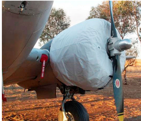
Beech D-18 Engine Covers, Center Section Oil Cooler Inlet Plugs, and Pitot Covers

This cover type is made from Silver Acrylic Sunbrella canvas and is 100% lined with a soft and smooth microfiber. Bruce's Custom Covers developed this material combination especially for aircraft protection. The outer material is medium weight and treated for water resistance, UV resistance and anti-static buildup. The inner lining is a very soft and smooth microfiber to prevent scratching. The material is very reflective, and tests show that the cabin interior temperature can be reduced to near-ambient temperature on the hottest of days. It is water, ice and snow repellent, yet breathable to allow moisture to escape from between the cover and the aircraft surface.