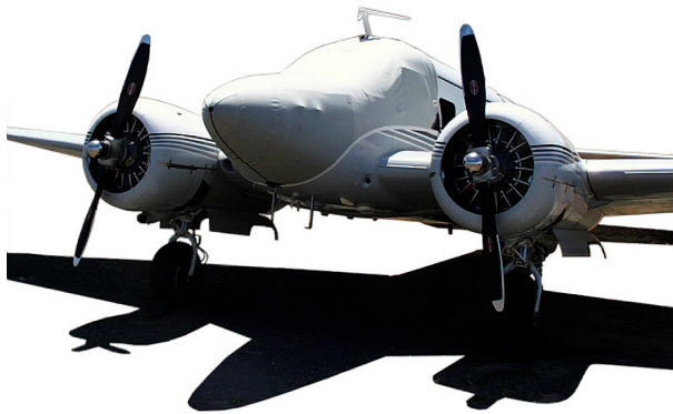
Beech 18 Cockpit/Nose Cover

This cover type is made from Silver Acrylic Sunbrella canvas and is 100% lined with a soft and smooth microfiber. Bruce's Custom Covers developed this material combination especially for aircraft protection. The outer material is medium weight and treated for water resistance, UV resistance and anti-static buildup. The inner lining is a very soft and smooth microfiber to prevent scratching. The material is very reflective, and tests show that the cabin interior temperature can be reduced to near-ambient temperature on the hottest of days. It is water, ice and snow repellent, yet breathable to allow moisture to escape from between the cover and the aircraft surface.