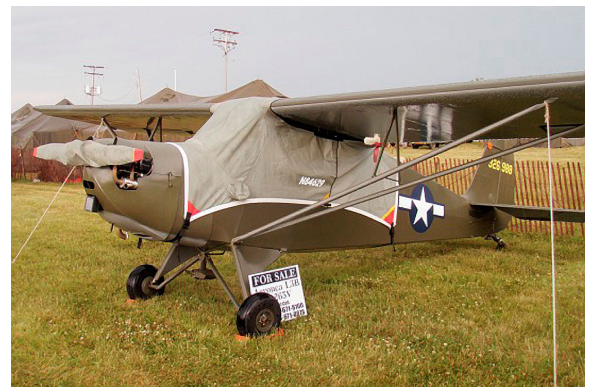
Aeronca 7AC Champ Canopy & Prop Covers