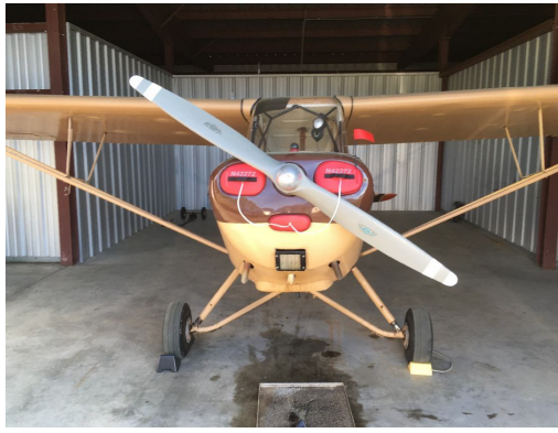
Aeronca Champ Engine Plugs, set of 3