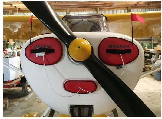
Aeronca 7AC Engine Inlet Plugs