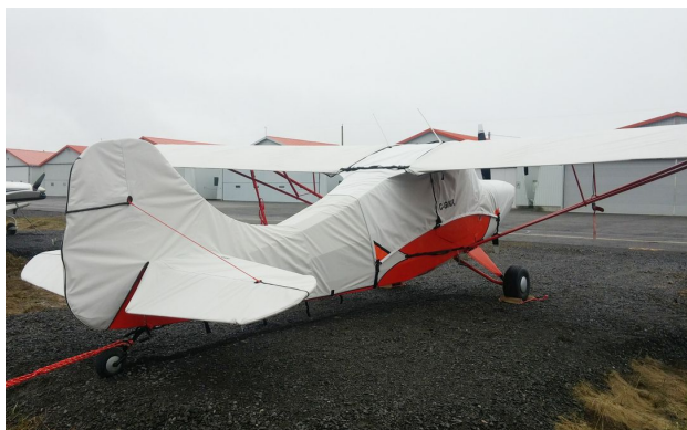
Aeronca Champ 7EC Canopy, Engine, Wing & Empennage Covers

WINTER USE MATERIAL - Made with Solution-Dyed Polyester fabric, this option is intended for seasonal use to aid in deicing, rain mitigation, or for occasional travel. The material is lighter and more compact, but more susceptible to UV damage and may have a shorter useful life if used continuously outside than the all-year use material.