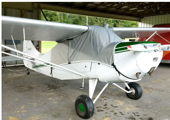
Aeronca Champ Light Weight Travel Canopy Cover, Over-Top Style

This cover type is made from Silver Acrylic Sunbrella canvas and is 100% lined with a soft and smooth microfiber. Bruce's Custom Covers developed this material combination especially for aircraft protection. The outer material is medium weight and treated for water resistance, UV resistance and anti-static buildup. The inner lining is a very soft and smooth microfiber to prevent scratching. The material is very reflective, and tests show that the cabin interior temperature can be reduced to near-ambient temperature on the hottest of days. It is water, ice and snow repellent, yet breathable to allow moisture to escape from between the cover and the aircraft surface.