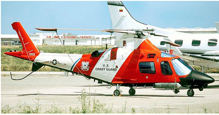
Covers, Plugs, HeatShields and related items for the Agusta MH-68A