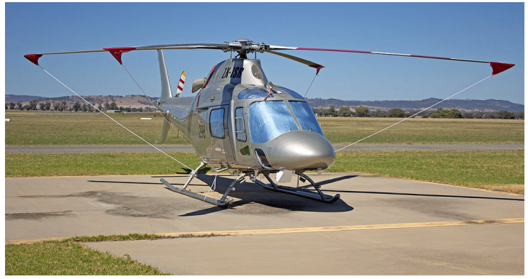
Agusta 119 Cockpit/Cabin HeatShields