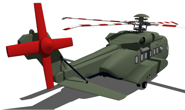
Sikorsky S-92 Tail Rotor Blade and Hub Covers

WINTER USE MATERIAL - Made with Solution-Dyed Polyester fabric, this option is intended for seasonal use to aid in deicing, rain mitigation, or for occasional travel. The material is lighter and more compact, but more susceptible to UV damage and may have a shorter useful life if used continuously outside than the all-year use material.