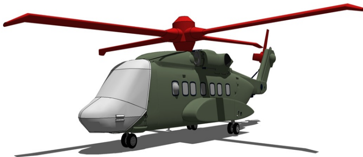
Sikorsky S-92 Windshield/Nose, Blade, Rotor Hub &amp; Tail Rotor Covers

This cover type is made from Silver Acrylic Sunbrella canvas and is 100% lined with a soft and smooth microfiber. Bruce's Custom Covers developed this material combination especially for aircraft protection. The outer material is medium weight and treated for water resistance, UV resistance and anti-static buildup. The inner lining is a very soft and smooth microfiber to prevent scratching. The material is very reflective, and tests show that the cabin interior temperature can be reduced to near-ambient temperature on the hottest of days. It is water, ice and snow repellent, yet breathable to allow moisture to escape from between the cover and the aircraft surface.