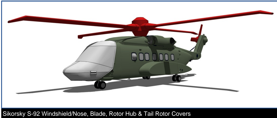
Sikorsky S-92 Windshield/Nose, Blade, Rotor Hub &amp; Tail Rotor Covers