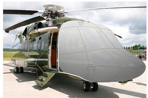
Sikorsky S-92 Windshield/Nose Cover (illustration)