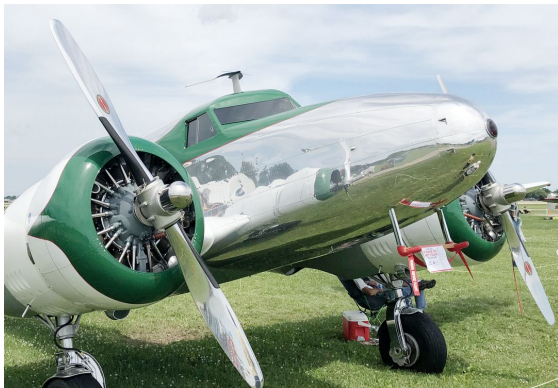
Lockheed 12 Pitot Covers

Lockheed 12 Electra Pitot Tube Covers , NOT HEAT RESISTANT TYPE, are made of Naugahyde vinyl, and are designed to cover the entire pitot assembly. Slipping over the tube, the cover tightens around the base with a Velcro strap detail. A "Remove Before Flight" streamer is attached to the cover. Heat Resistant Pitot Covers are an upgrade to this design, and help prevent the pitot cover from melting onto the tube if the pitot heat is accidentally turned on while installed. If you want the set tethered together, please let us know.