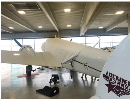
Lockheed 12 Canopy/Nose Cover

This cover type is made from Silver Acrylic Sunbrella canvas and is 100% lined with a soft and smooth microfiber. Bruce's Custom Covers developed this material combination especially for aircraft protection. The outer material is medium weight and treated for water resistance, UV resistance and anti-static buildup. The inner lining is a very soft and smooth microfiber to prevent scratching. The material is very reflective, and tests show that the cabin interior temperature can be reduced to near-ambient temperature on the hottest of days. It is water, ice and snow repellent, yet breathable to allow moisture to escape from between the cover and the aircraft surface.