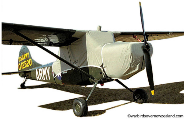
Cessna L-19 Canopy & Engine Covers

water resistance, UV resistance and anti-static buildup. The inner lining is a very soft and smooth microfiber to prevent scratching. The material is very reflective, and tests show that the cabin interior temperature can be reduced to near-ambient temperature on the hottest of days. It is water, ice and snow repellent, yet breathable to allow moisture to escape from between the cover and the aircraft surface.