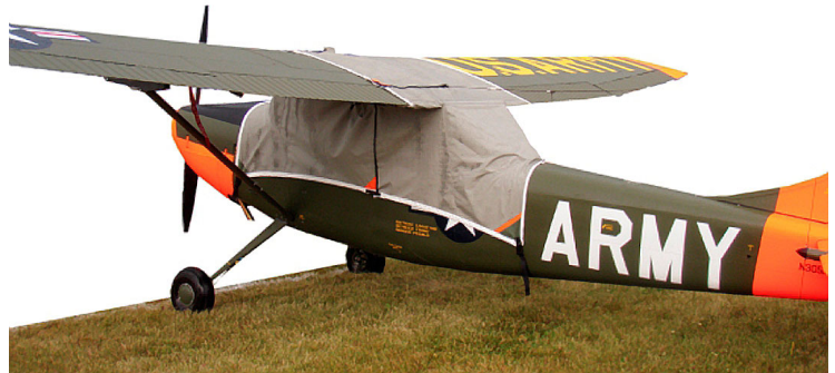
L-19 Canopy Cover