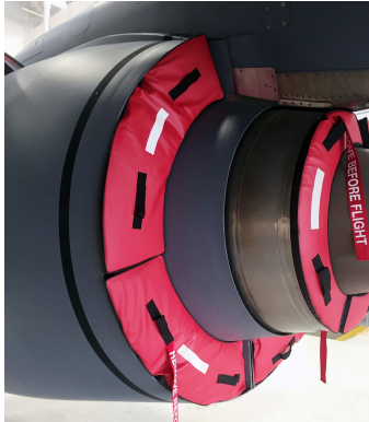
Boeing KC-135 Bypass Vent & Exhaust Plugs

The Engine Inlet Plugs are custom fit for your Boeing KC-135, C-135, RC-135, EC-135 intakes, made with heavy-duty vinyl material, and stuffed with a single block of sculpted urethane foam. Each plug has a zipper that allows the foam to be removed and dried if necessary. Engine plugs have 'remove before flight' streamers sewn onto the face of the plugs. Most plugs are imprinted with the aircraft registration number in black for an extra charge. Storage bag NOT included. Engine plugs may be inserted after flight when the engine is still warm. Engine Inlet Plugs are commonly referred to as Cowl Plugs, Intake Plugs, Cowl Blocks, Engine Blocks, and Engine Bungs.