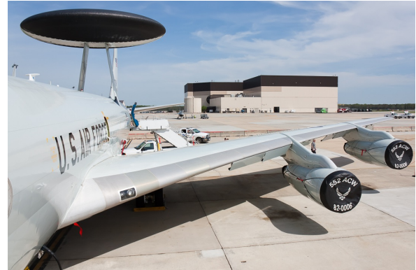
Boeing E-3C Engine Covers