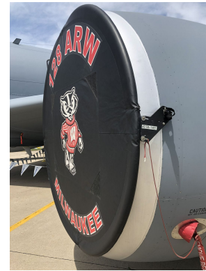
Boeing KC-135 Intake Covers, Tambourine Type