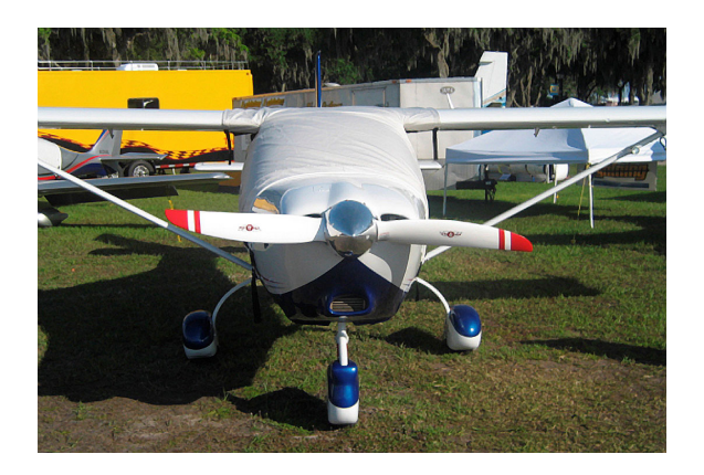
Jabiru 230-SP Canopy Cover, Over-top style