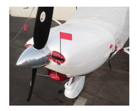
Jabiru 430 Engine Inlet Plugs