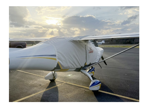
Jabiru J230-SP Extended Canopy Cover

This cover type is made from Silver Acrylic Sunbrella canvas and is 100% lined with a soft and smooth microfiber. Bruce's Custom Covers developed this material combination especially for aircraft protection. The outer material is medium weight and treated for water resistance, UV resistance and anti-static buildup. The inner lining is a very soft and smooth microfiber to prevent scratching. The material is very reflective, and tests show that the cabin interior temperature can be reduced to near-ambient temperature on the hottest of days. It is water, ice and snow repellent, yet breathable to allow moisture to escape from between the cover and the aircraft surface.