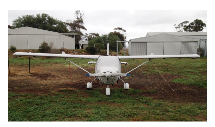
Jabiru 160 Canopy, Engine, Prop. Wings & Empennage Covers