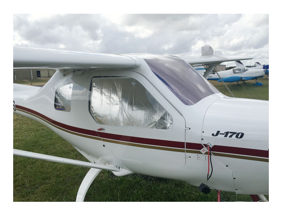
Jabiru 170 Heatshield Set

Heatshields are interior sunshades for an aircraft's windows or canopy glass. The product is a unique composite of closed-cell foam with a silver mylar finish. The semi-rigid design is stiff enough to stand along the inside of the windshield using sun visors or window framing. It folds up flat and easily stores in the included storage sleeve. Some designs may require velcro and suction cups. A Heatshield is an excellent short-term remedy for cockpit overheating.