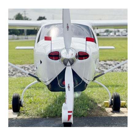
Jabiru J230-SP Engine Inlet Plugs