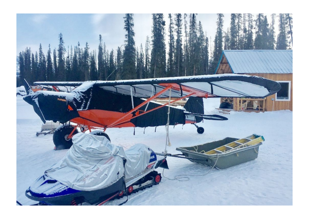
Piper PA-18 Super Cub Canopy Cover (Over-The-Top Style)

WINTER USE MATERIAL - Made with Solution-Dyed Polyester fabric, this option is intended for seasonal use to aid in deicing, rain mitigation, or for occasional travel. The material is lighter and more compact, but more susceptible to UV damage and may have a shorter useful life if used continuously outside than the all-year use material.