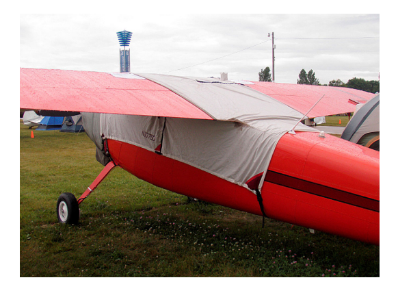
Over-Top Canopy Cover & Engine Cover