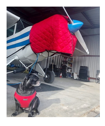
Piper PA-12 Insulated Hangar Blanket

This cover type is made from Silver Acrylic Sunbrella canvas and is 100% lined with a soft and smooth microfiber. Bruce's Custom Covers developed this material combination especially for aircraft protection. The outer material is medium weight and treated for water resistance, UV resistance and anti-static buildup. The inner lining is a very soft and smooth microfiber to prevent scratching. The material is very reflective, and tests show that the cabin interior temperature can be reduced to near-ambient temperature on the hottest of days. It is water, ice and snow repellent, yet breathable to allow moisture to escape from between the cover and the aircraft surface.