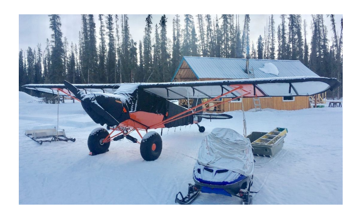
Piper PA-18 Super Cub Canopy Cover (Over-The-Top Style)