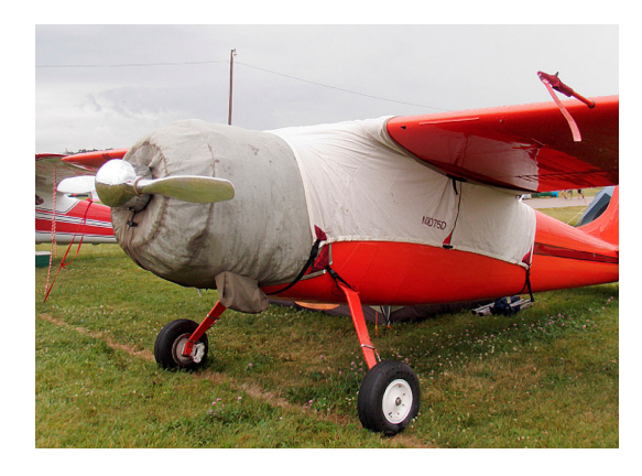
Cessna 195 Over-Top Canopy Cover & Engine Cover

This cover type is made from Silver Acrylic Sunbrella canvas and is 100% lined with a soft and smooth microfiber. Bruce's Custom Covers developed this material combination especially for aircraft protection. The outer material is medium weight and treated for water resistance, UV resistance and anti-static buildup. The inner lining is a very soft and smooth microfiber to prevent scratching. The material is very reflective, and tests show that the cabin interior temperature can be reduced to near-ambient temperature on the hottest of days. It is water, ice and snow repellent, yet breathable to allow moisture to escape from between the cover and the aircraft surface.