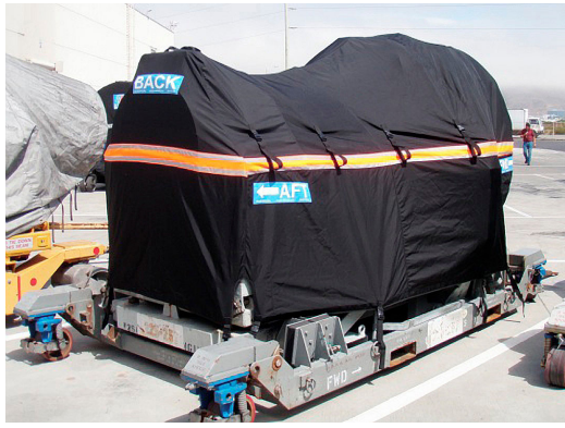
IAE V2500 QEC OFF-LINK JET ENGINE COVER, "rain cap" style