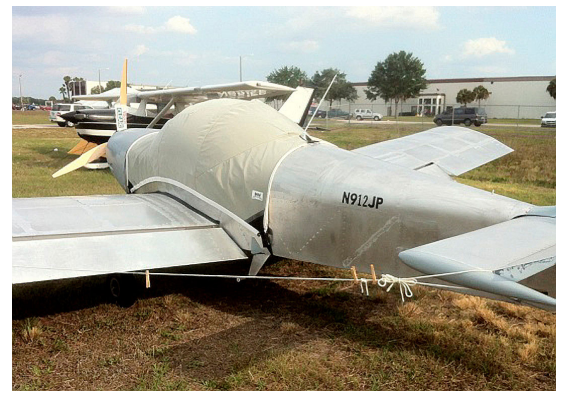
Zenith 601 XL Canopy Cover