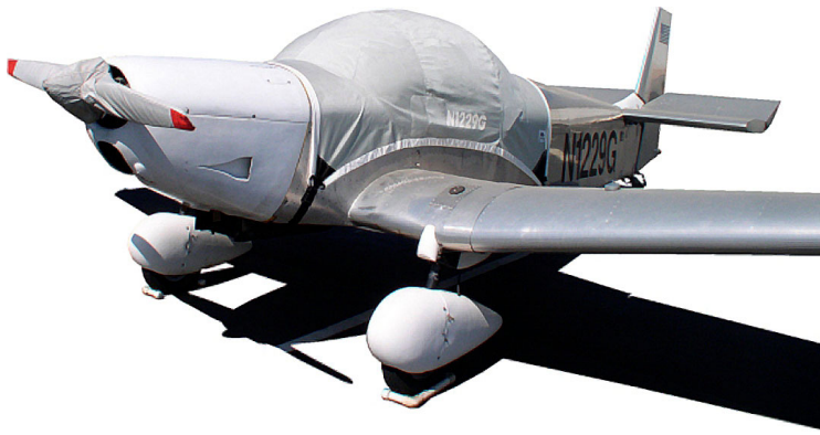
Zenith CH601 Canopy Cover & Prop Cover