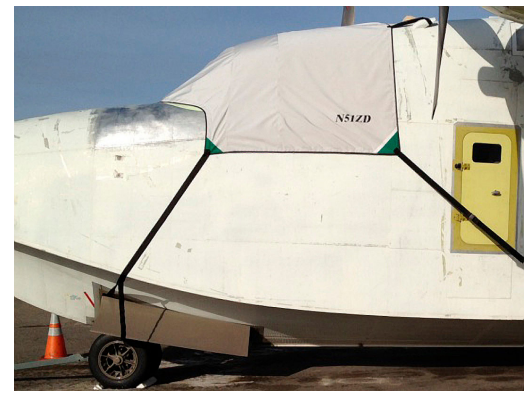
Grumman HU-16 Albatross Cockpit/Nose Cover and Engine Cover(test fit covers)