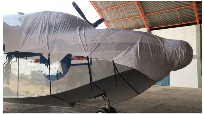
Grumman HU-16 Albatross Cockpit/Nose Cover (test fit cover)