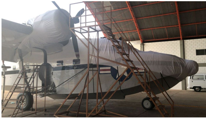
Grumman HU-16 Albatross Cockpit/Nose Cover and Engine Cover(test fit covers)

This cover type is made from Silver Acrylic Sunbrella canvas and is 100% lined with a soft and smooth microfiber. Bruce's Custom Covers developed this material combination especially for aircraft protection. The outer material is medium weight and treated for water resistance, UV resistance and anti-static buildup. The inner lining is a very soft and smooth microfiber to prevent scratching. The material is very reflective, and tests show that the cabin interior temperature can be reduced to near-ambient temperature on the hottest of days. It is water, ice and snow repellent, yet breathable to allow moisture to escape from between the cover and the aircraft surface.