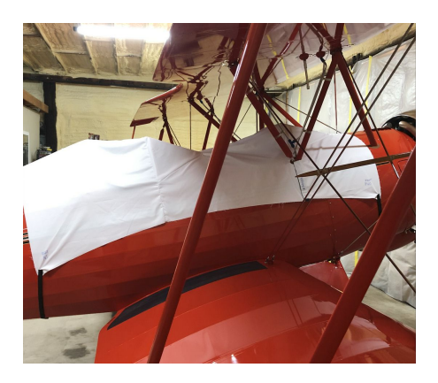
Hatz Biplane Canopy Cover, test fit cover