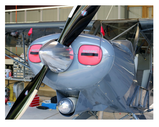
Piper PA-18 Super Cub Engine Inlet Plugs