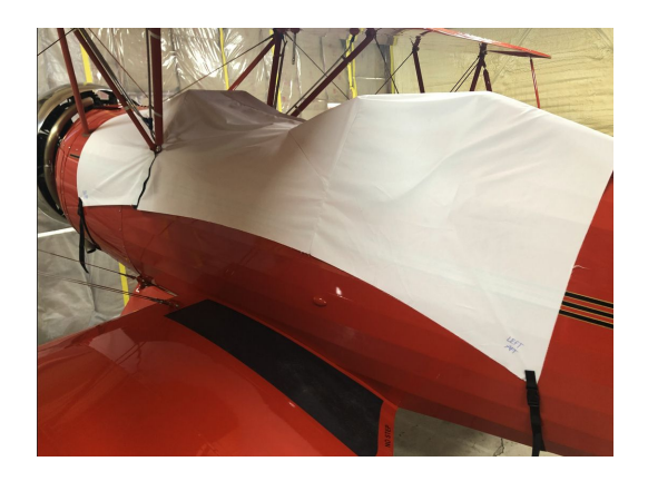
Hatz Biplane Canopy Cover, test fit cover

This cover type is made from Silver Acrylic Sunbrella canvas and is 100% lined with a soft and smooth microfiber. Bruce's Custom Covers developed this material combination especially for aircraft protection. The outer material is medium weight and treated for water resistance, UV resistance and anti-static buildup. The inner lining is a very soft and smooth microfiber to prevent scratching. The material is very reflective, and tests show that the cabin interior temperature can be reduced to near-ambient temperature on the hottest of days. It is water, ice and snow repellent, yet breathable to allow moisture to escape from between the cover and the aircraft surface.