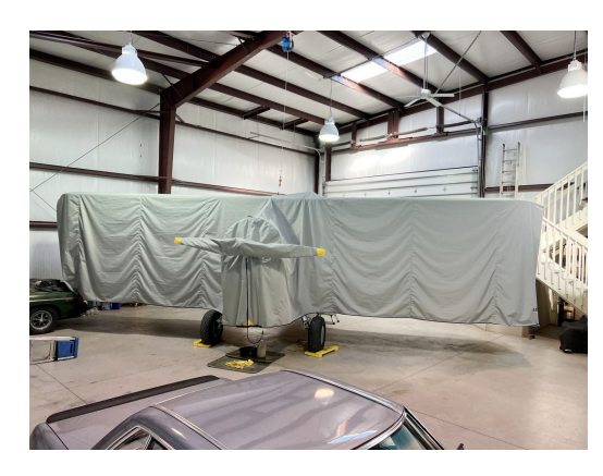
Stearman PT-13 Full Body Dust Cover