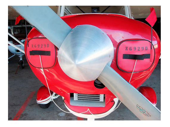
Piper PA-22-150 Engine Inlet Plugs (set of 3)

Engine Inlet Plugs are custom fit for your Hatz Biplane CB-1 intakes, made with heavy-duty vinyl material, and stuffed with a single block of sculpted urethane foam. Each plug has a zipper that allows the foam to be removed and dried if necessary. Engine plugs have warning flags that are visible from the cockpit or 'remove before flight' streamers sewn onto the face of the plugs. Most plugs are imprinted with the aircraft registration number in black for an extra charge. Storage bag NOT included. Engine plugs may be inserted after flight when the engine is still warm. Engine Inlet Plugs are commonly referred to as Cowl Plugs, Intake Plugs, Cowl Blocks, Engine Blocks, and Engine Bungs.