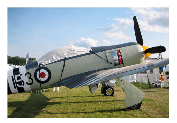
Hawker Sea Fury Canopy Cover, Exhaust Plugs, Wingroot Inlet Plugs