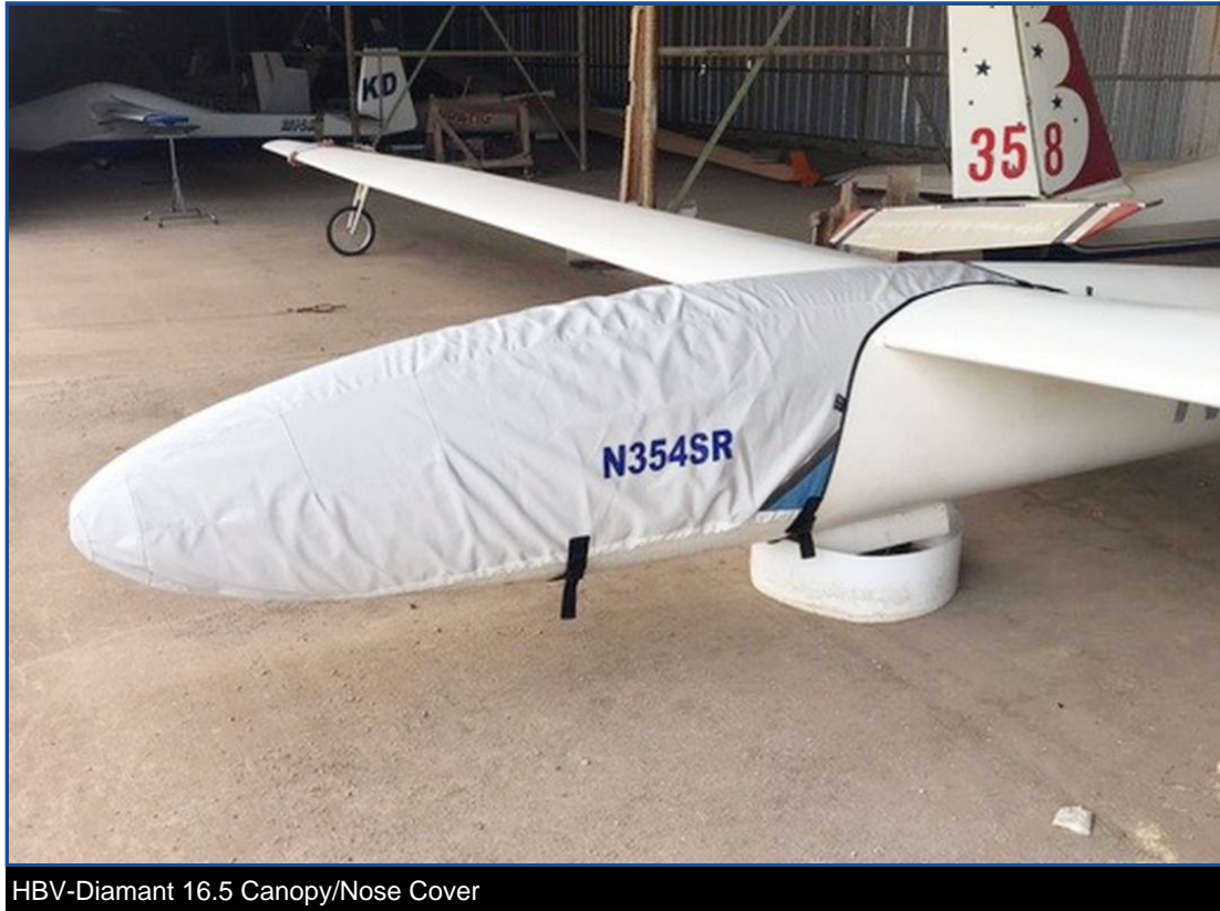
HBV-Diamant 16.5 Canopy/Nose Cover