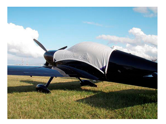
Harmon Rocket III Canopy Cover