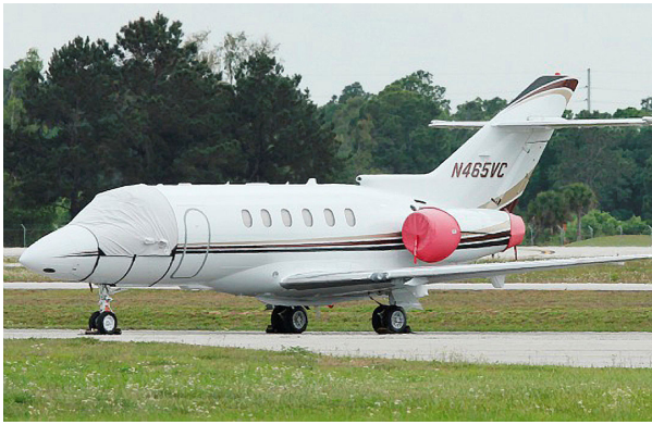
Hawker 800 Cockpit Cover and Engine Covers set