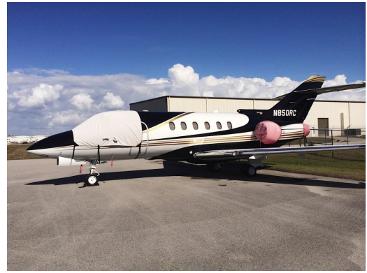
Hawker 800 Cockpit Cover, extended aft 24"