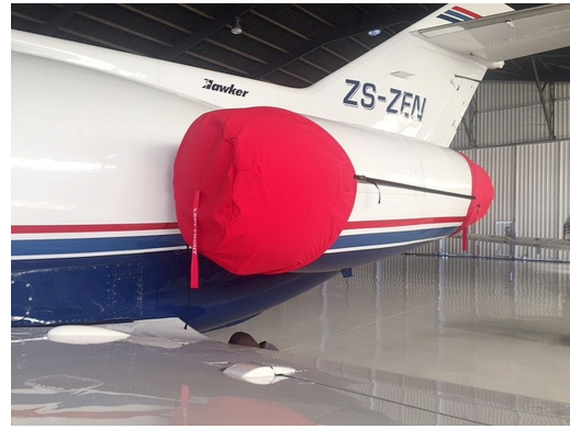
Hawker Beechcraft 800, 800XP, 850XP Engine Covers (With Tr's)