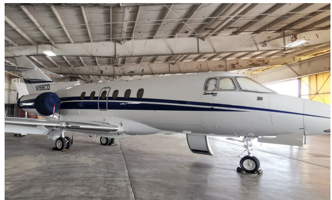
Hawker 750 HeatShields & Engine Covers