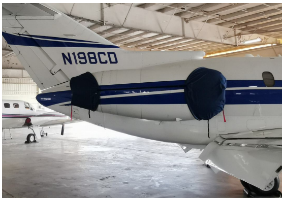
Hawker 750 Engine Covers

Cockpit Heatshields are interior sunshades for the aircraft's cockpit. The product is a unique composite of closed-cell foam with a silver mylar finish. The semi-rigid design is stiff enough to stand inside the window framing. The set folds up flat and is easily stored in the included storage sleeve. Some designs may require velcro and suction cups. Our Heatshields for jets are offered white side out because some aircraft manufacturers have issued advisories against reflective window inserts due to potential heat damage. A Heatshield is an excellent short-term remedy for cockpit overheating, but an external fabric cover is more effective for long-term protection.