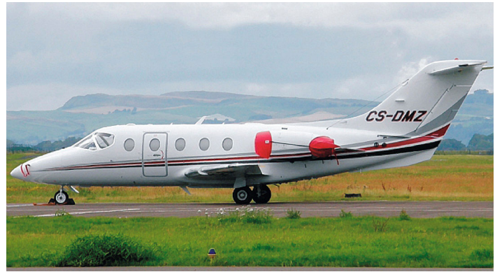
Beechjet 400 Engine & Pitot Covers