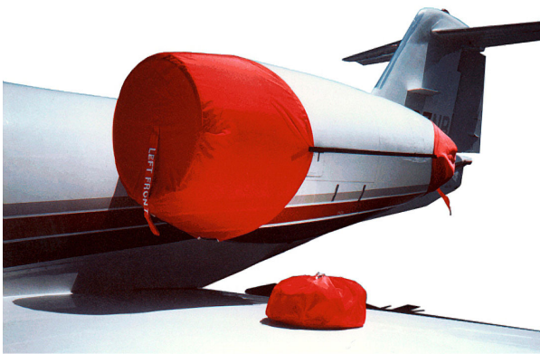
Lear 35 Engine Covers

The Hawker Beechcraft 1000 Intake Covers are designed to install easily yet be completely storable. A spring steel hoop is sewn into the hem of each cover, allowing them to be installed without climbing onto the wing or using a stepladder. To store the covers the spring steel hoop folds like a band-saw blade into three nesting rings. Each cover folds into a compact circular bundle which is stored in the included duffle bag, yet they unfold quickly for use. The Tri-Fold Ring cover is made of medium weight nylon which is available in a variety of colors to match the paint trim. Each cover set comes complete with installation and folding instructions. The aircraft's registration number can be silkscreened onto the cover for an extra charge.