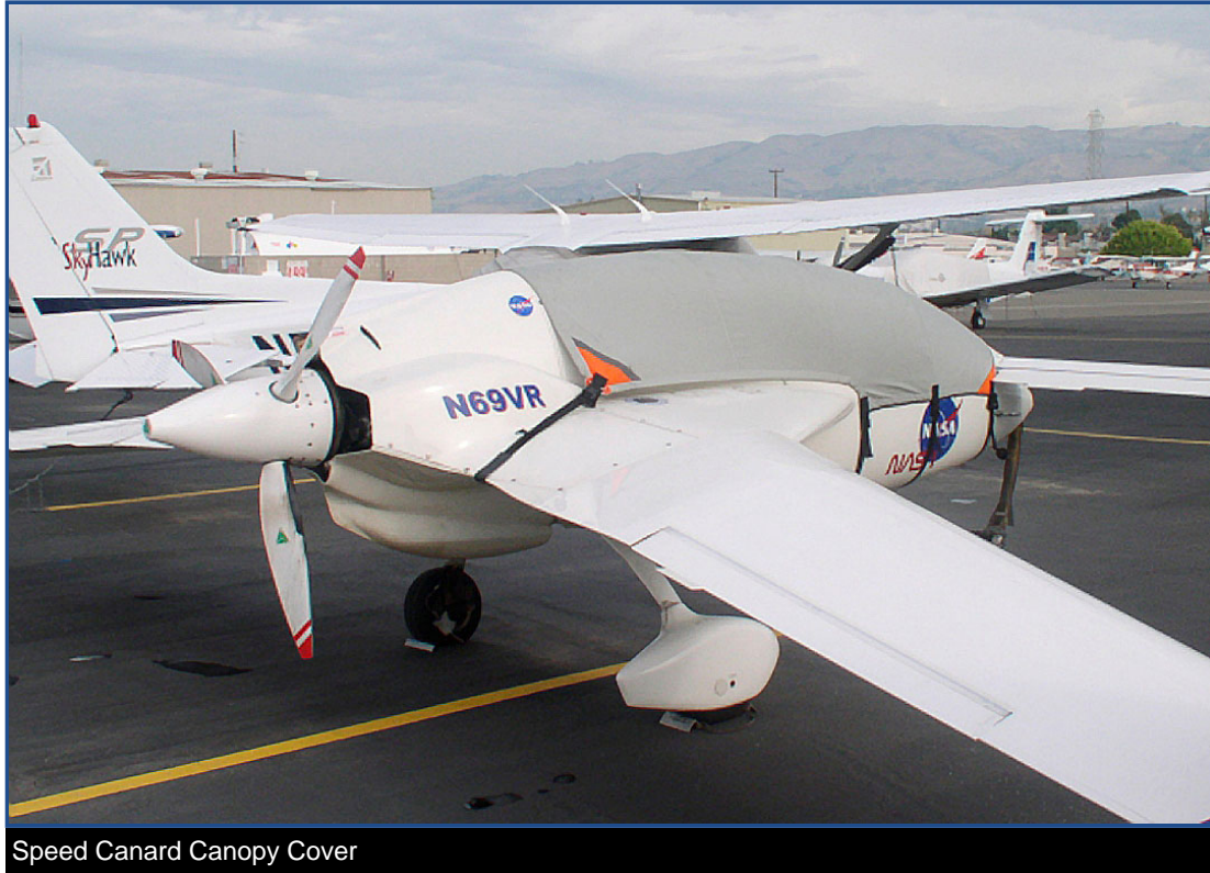
Speed Canard Canopy Cover