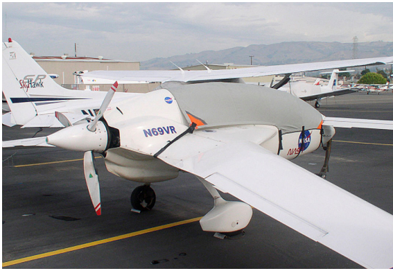
Speed Canard Canopy Cover