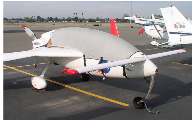
Gyroflug Speed Canard Canopy Cover