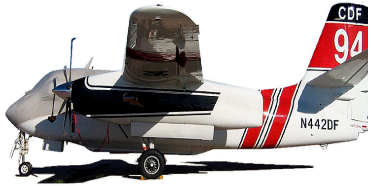
Grumman Tracker (turbine model) Canopy/Nose Cover