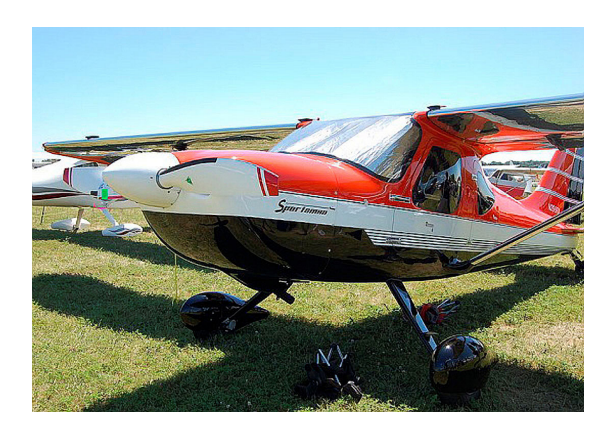
Glastar Sportsman Windshield HeatShield

Windshield Heatshields are interior sunshades for an aircraft's front windshield. The product is a unique composite of closed-cell foam with a silver mylar finish. The semi-rigid design is stiff enough to stand along the inside of the windshield using sun visors or window framing. It folds up flat and easily stores in the included storage sleeve. Some designs may require velcro and suction cups or split right and left sides. A Heatshield is an excellent short-term remedy for cockpit overheating. An external fabric cover is far more effective and practical for long-term protection.