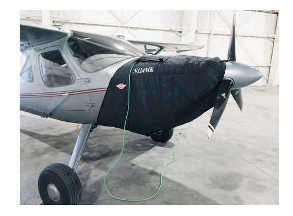
Glasair Aviation Glastar, Sportsman 2+2 Insulated Engine Cover