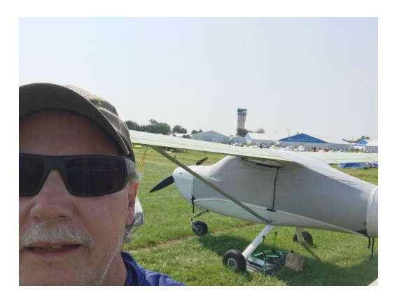
Glastar Sportsman Travel Weight Canopy Cover