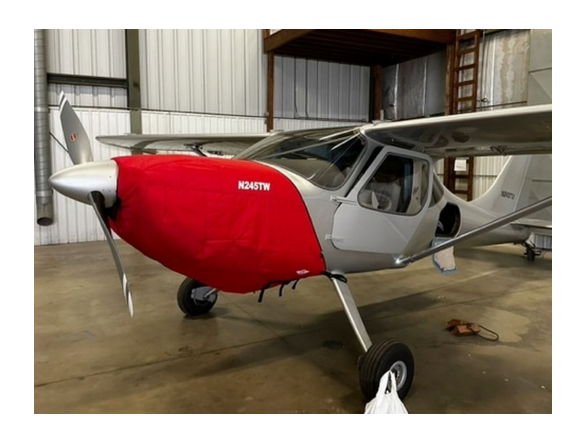
Glastar Insulated Engine Cover

This cover type is made from Silver Acrylic Sunbrella canvas and is 100% lined with a soft and smooth microfiber. Bruce's Custom Covers developed this material combination especially for aircraft protection. The outer material is medium weight and treated for water resistance, UV resistance and anti-static buildup. The inner lining is a very soft and smooth microfiber to prevent scratching. The material is very reflective, and tests show that the cabin interior temperature can be reduced to near-ambient temperature on the hottest of days. It is water, ice and snow repellent, yet breathable to allow moisture to escape from between the cover and the aircraft surface.