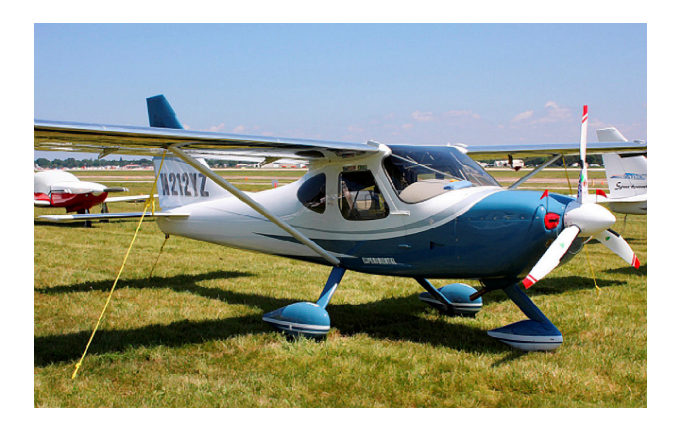
Glastar Sportsman Engine Inlet Plugs

Engine Inlet Plugs are custom fit for your Glasair Aviation Glastar, Sportsman 2+2 intakes, made with heavy-duty vinyl material, and stuffed with a single block of sculpted urethane foam. Each plug has a zipper that allows the foam to be removed and dried if necessary. Engine plugs have warning flags that are visible from the cockpit or 'remove before flight' streamers sewn onto the face of the plugs. Most plugs are imprinted with the aircraft registration number in black for an extra charge. Storage bag NOT included. Engine plugs may be inserted after flight when the engine is still warm. Engine Inlet Plugs are commonly referred to as Cowl Plugs, Intake Plugs, Cowl Blocks, Engine Blocks, and Engine Bungs.