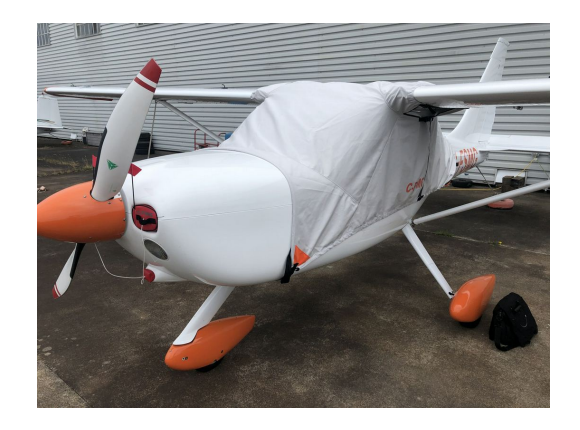
Glastar Canopy Cover, Engine Plugs