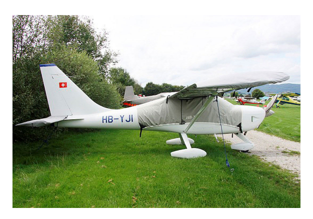
Glastar Canopy, Wings, Horizontal Stab. & Prop Covers

WINTER USE MATERIAL - Made with Solution-Dyed Polyester fabric, this option is intended for seasonal use to aid in deicing, rain mitigation, or for occasional travel. The material is lighter and more compact, but more susceptible to UV damage and may have a shorter useful life if used continuously outside than the all-year use material.