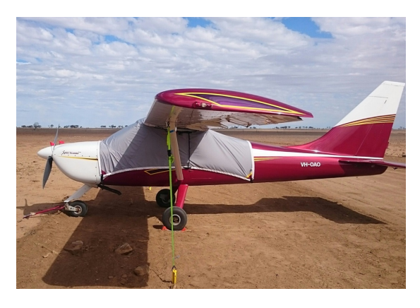
Glastar Sportsman Light Weight Travel Cover