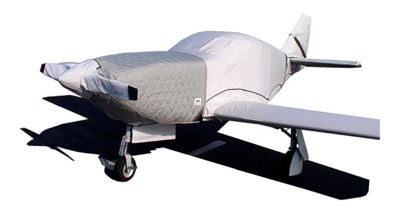
Glasair I Insulated Engine Cover, Prop Cover, Etc.

WINTER USE MATERIAL - Made with Solution-Dyed Polyester fabric, this option is intended for seasonal use to aid in deicing, rain mitigation, or for occasional travel. The material is lighter and more compact, but more susceptible to UV damage and may have a shorter useful life if used continuously outside than the all-year use material.