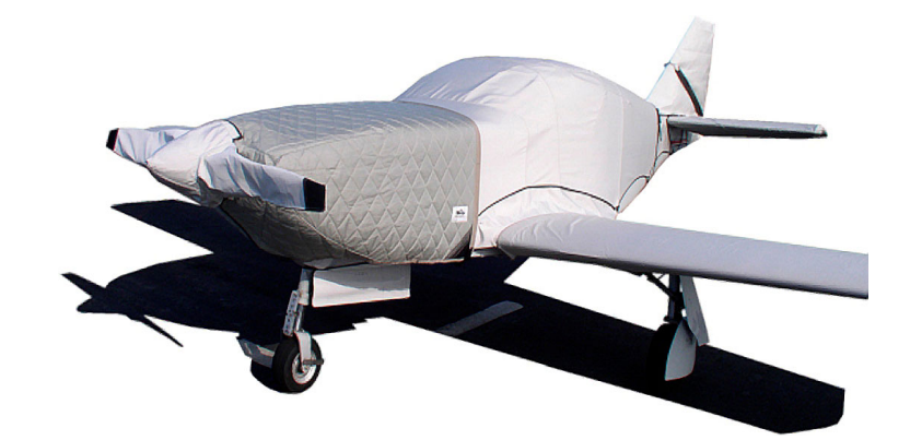
Glasair Aviation Glasair II & III Propellor/Spinner Cover, 2 Blade