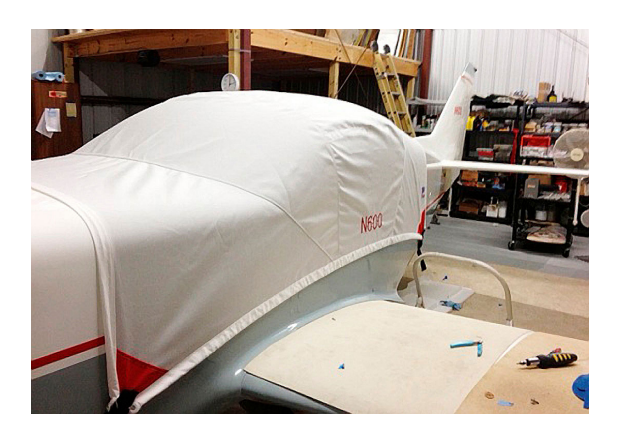
Glasair II/III Canopy Cover

This cover type is made from Silver Acrylic Sunbrella canvas and is 100% lined with a soft and smooth microfiber. Bruce's Custom Covers developed this material combination especially for aircraft protection. The outer material is medium weight and treated for water resistance, UV resistance and anti-static buildup. The inner lining is a very soft and smooth microfiber to prevent scratching. The material is very reflective, and tests show that the cabin interior temperature can be reduced to near-ambient temperature on the hottest of days. It is water, ice and snow repellent, yet breathable to allow moisture to escape from between the cover and the aircraft surface.