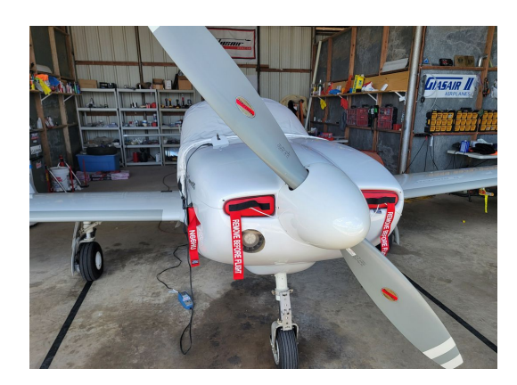
GLASAIR S2-RG Canopy Cover, Engine Plugs