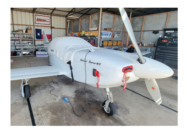
GLASAIR S2-RG Canopy Cover, Engine Plugs