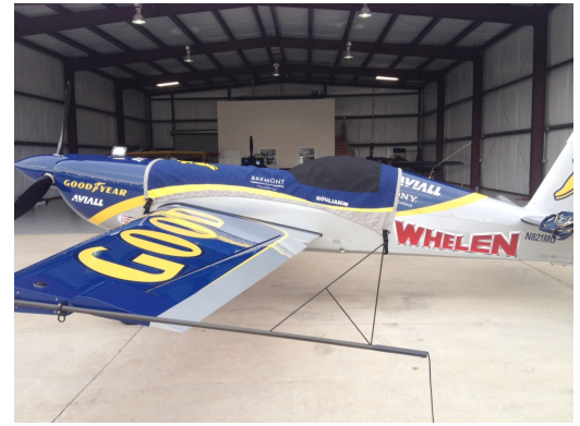
Extra 300SC with NASCAR style custom cover