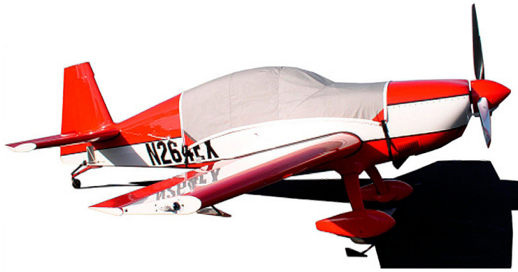
Canopy Cover for the Extra 300