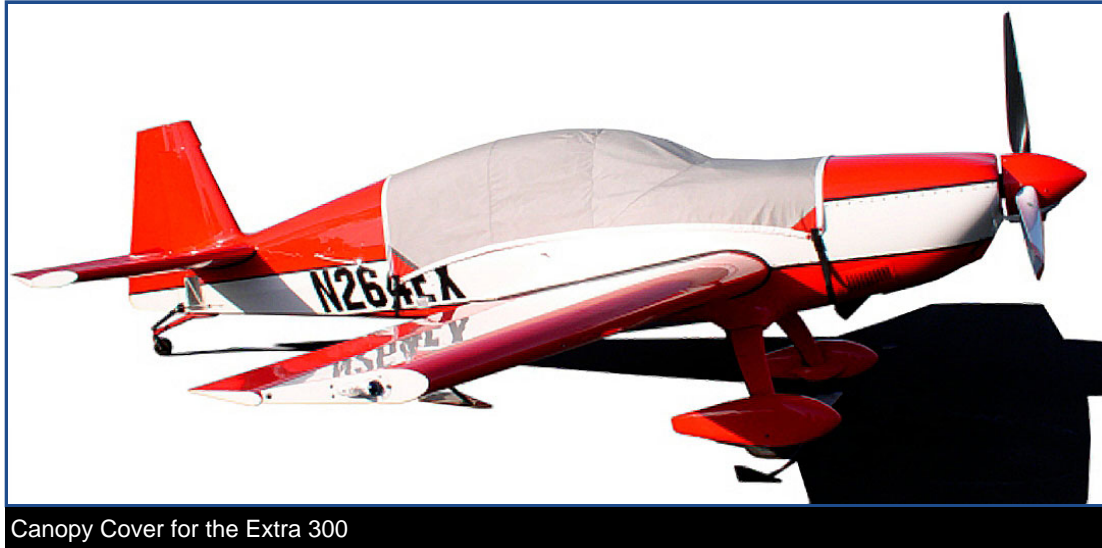
Canopy Cover for the Extra 300