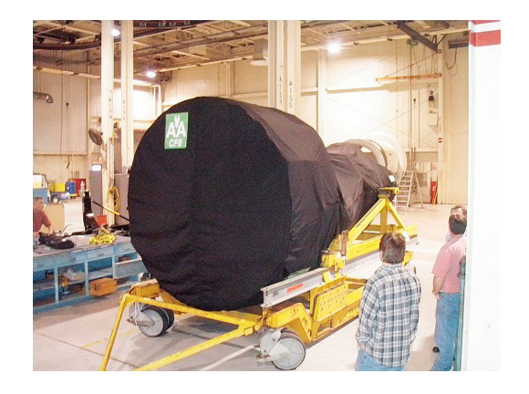
GE CF-6 QEC Engine Long-term Storage/Transport Cover "Bag" GE CF-6 QEC Engine Long-term Storage/Transport Cover "Bag" (Boeing 767) (Boeing 767)