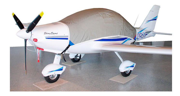
Sting Sport Canopy Cover & Engine Plugs