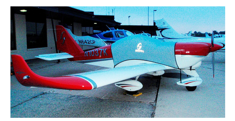
Gobosh 800XP Travel Cover, Light Weight Travel Canopy Cover and Inlet Plugs