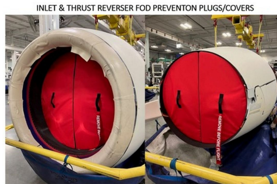
Gulfstream G500 FOD protection plugs for mfg process