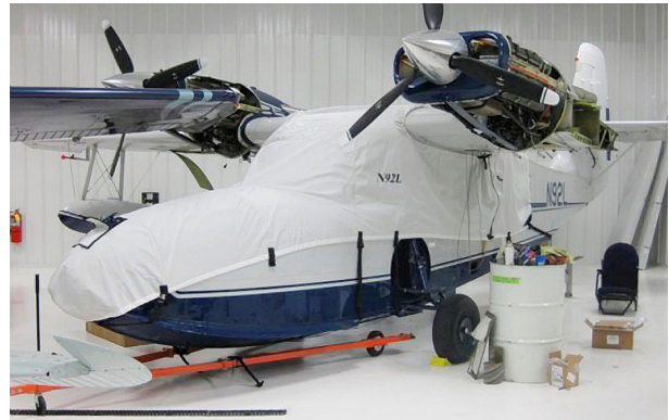
Grumman G44 Widgeon Canopy/Nose Cover