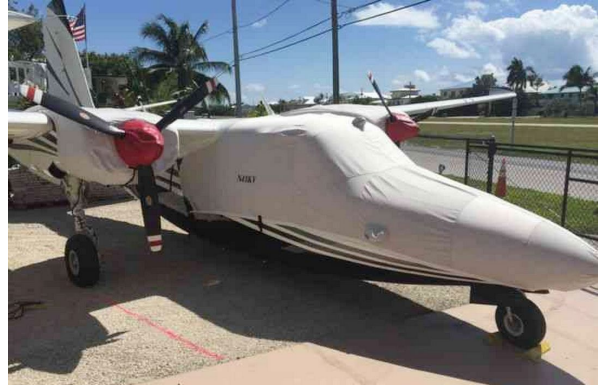
Twin Commander 560F Canopy/Nose & Engine Covers