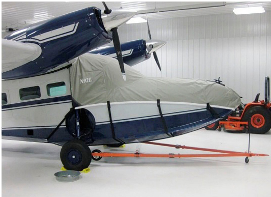
Grumman G44 Widgeon Cockpit/Nose Cover

Travel Covers are made with Silver Solution-Dyed Polyester fabric and only lined over the windshield to save weight. The material is lightweight and more compact for easy stowage in the aircraft. The polyester material is water resistant, but only intended for occasional use outside. We also have an ultra lightweight material available for fitted hangar dust covers. For daily outdoor use, the non-travel Sunbrella Cover is the best choice.