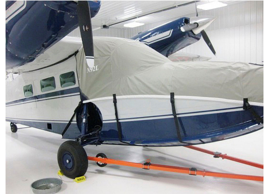
Grumman G44 Widgeon Cockpit/Nose Cover