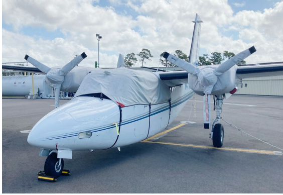
Aero Commander 500S Shrike Canopy, Engine & Prop Covers

The material is very reflective, and tests show that the cabin interior temperature can be reduced to near-ambient temperature on the hottest of days. It is water, ice and snow repellent, yet breathable to allow moisture to escape from between the cover and the aircraft surface.