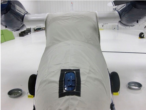
Grumman Widgeon Cockpit/Nose Cover, tie-down cleat detail

This cover type is made from Silver Acrylic Sunbrella canvas and is 100% lined with a soft and smooth microfiber. Bruce's Custom Covers developed this material combination especially for aircraft protection. The outer material is medium weight and treated for water resistance, UV resistance and anti-static buildup. The inner lining is a very soft and smooth microfiber to prevent scratching. The material is very reflective, and tests show that the cabin interior temperature can be reduced to near-ambient temperature on the hottest of days. It is water, ice and snow repellent, yet breathable to allow moisture to escape from between the cover and the aircraft surface.