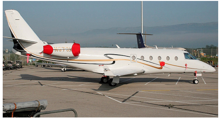
Engine Cover Set