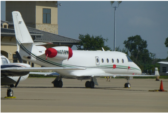
Gulfstream G150 Engine Cover Set