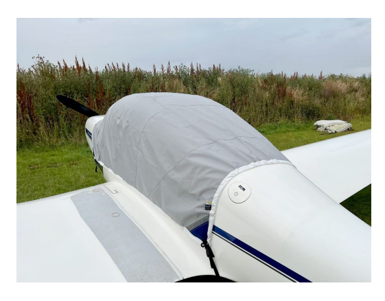
Grob 109 Travel Cover, Light Weight Canopy Cover