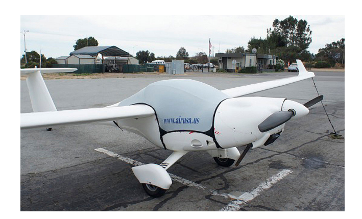
Lambada Travel Canopy Cover