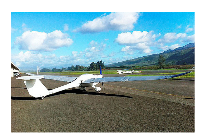
Lambada Canopy/Engine Cover and Wing Covers