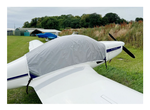
Grob 109 Travel Cover, Light Weight Canopy Cover