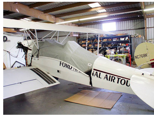
Fairchild KR-34 Canopy Cover