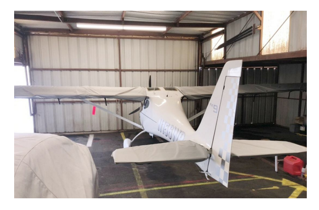
FK 9 MARK IV Wing & Horizontal Stabilizer Dust Covers