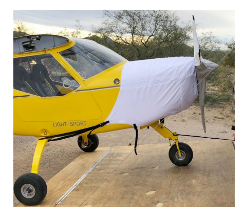
FK-9 Engine Cover, test fit cover

This cover type is made from Silver Acrylic Sunbrella canvas and is 100% lined with a soft and smooth microfiber. Bruce's Custom Covers developed this material combination especially for aircraft protection. The outer material is medium weight and treated for water resistance, UV resistance and anti-static buildup. The inner lining is a very soft and smooth microfiber to prevent scratching. The material is very reflective, and tests show that the cabin interior temperature can be reduced to near-ambient temperature on the hottest of days. It is water, ice and snow repellent, yet breathable to allow moisture to escape from between the cover and the aircraft surface.