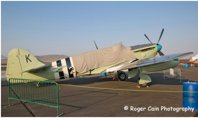
Fairey Firefly Canopy Cover