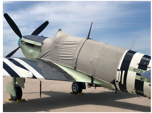
Fairey Firefly Canopy Cover